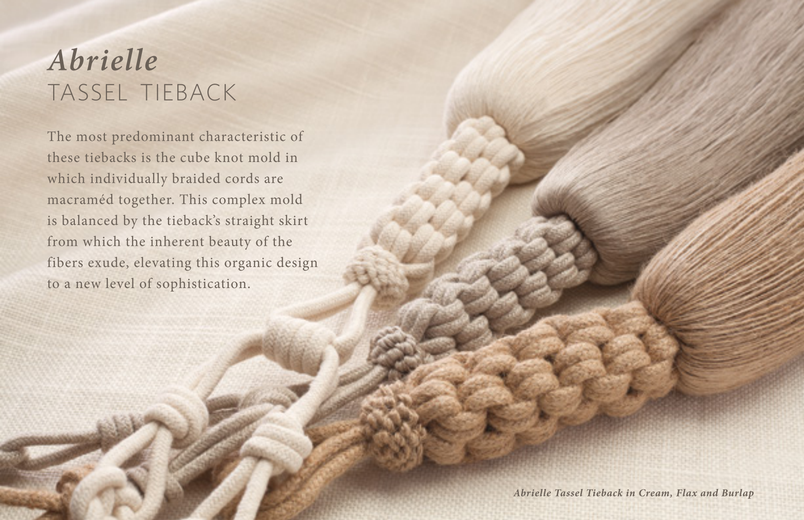
Abrielle Tassel Tieback in Cream, Flax and Burlap

The most predominant characteristic of these tiebacks is the cube knot mold in which individually braided cords are macraméd together. This complex mold is balanced by the tieback's straight skirt from which the inherent beauty of the fibers exude, elevating this organic design to a new level of sophistication.